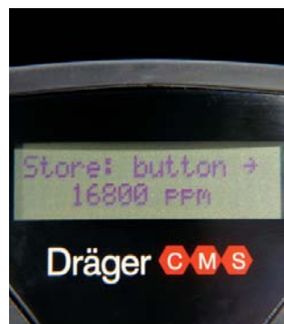
Data Recorder Stores up to 50 measurements in the analyzer

THE CMS CHIP CONSISTS OF 10 MEASUREMENT CAPILLARIES FILLED WITH SUBSTANCE-SPECIFIC REAGENT SYSTEMS. THE GAS TYPE, PART NUMBER AND BATCH NUMBER ARE PRINTED ON THE CHIP. A PRINTED BARCODE ON THE CHIP, READ BY THE ANALYZER OPTICS, CONTAINS INFORMATION ABOUT GAS TYPE, MEASURING RANGE AND MEASURING TIME REQUIRED FOR COMPLETING THE MEASUREMENT. EACH CHIP IS CALIBRATED DURING MANUFACTURING AND IS VALID FOR TWO YEARS.