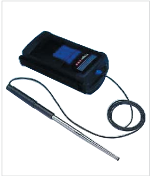
Remote Sampling with Probe