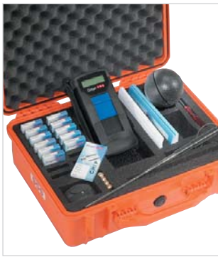
Emergency Response Kit