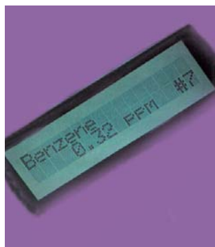
Accurate Measure quantities as low as 0.20 ppm Benzene