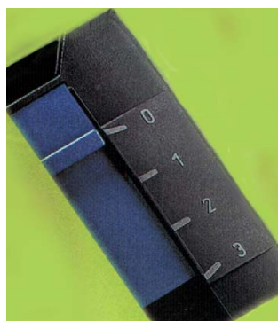
Easy as 1-2-3 Simple operation, simplified training